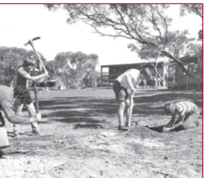
Scotts Creek circa 1977