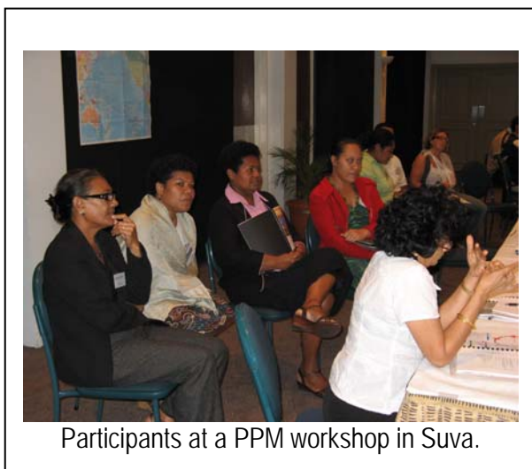
Participants at a PPM workshop in Suva.

In the first phase, FDC will select the women who will have access to the e-learning, management platform and governance leadership training materials. The selection will occur after the program's promotional campaign and will be based on how well the applicants address the selection criteria. A prerequisite for the applicants is to have some prior experience as budding leaders in their own communities or to have proven leadership qualities. FDC will select the best 65 applicants.